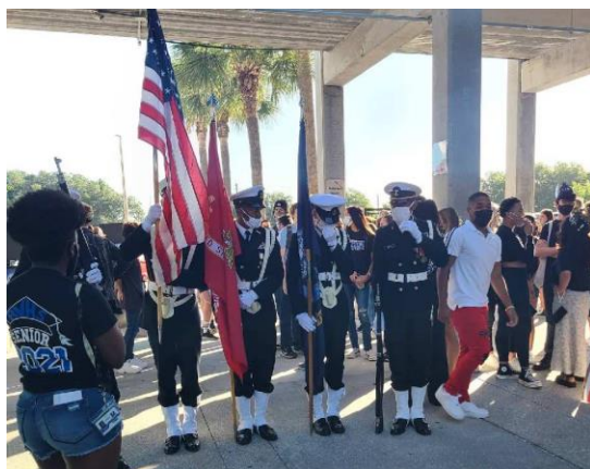
Shark Traditions: JROTC Color Guard members prepare to lead the Class of 2021 during their "Senior Walkout" to celebrate graduating high school.

assignments will also be posted in the lobbies of the auditorium and gym.