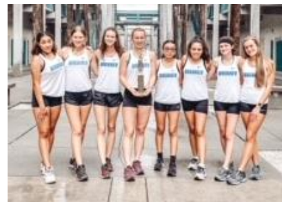
Riverview High School Girls Cross Country team celebrates being the East Hillsborough Conference champs.

prior to their predicted pick-up time. Buses will load and unload on the North side of the school (Boyette Road side). Please listen to your bus driver regarding bus location for loading at the end of the day (bus slot number). Proper bus conduct is mandatory as it ensures the safety of your child and other students being transported. If you have a child receiving specialized bus services, your bus driver will be contacting you in August with specific bus stop locations, times, and bus numbers.